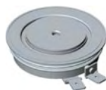
W34 Weight 120 g