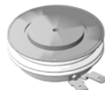
W35 Weight 300 g