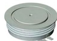
W36 Weight 500 g