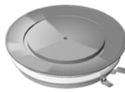
W31 Weight 800 g