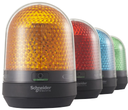
Ø 100 motor-less rotating beacon