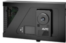
NetBotz Wall Monitor 755