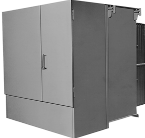
Liquid Filled Pad Mounted