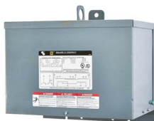
Type T and Type TF