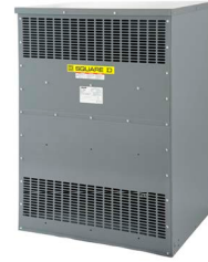
Style J—Type 1 Rated Converts to Type 2 with Drip Shield Converts to Type 3R with Weathershield