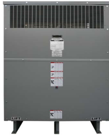
Style D, NEMA 1 Rated

Standard high voltage taps: 4-2.5%, 2FCAN and 2FCBN. Optional 4-2.5% FCBN