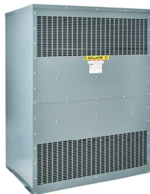
General Purpose Dry Type 600 Volts and Below