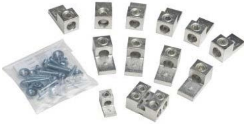
Table 14.11: Compression Lug Kits