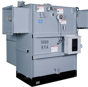
Liquid Filled Substation