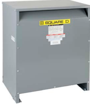
Style D and H—Type 2 Rated Converts to Type 3R with Weathershield