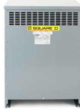
Style M—Type 2 Rated Converts to Type 3R with Weathershield