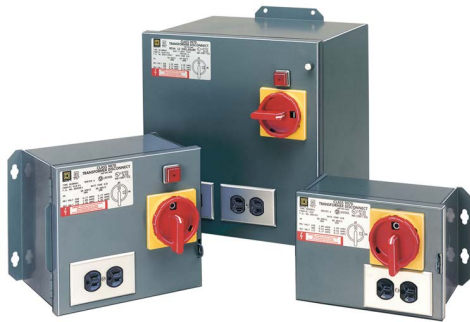
Transformer disconnects are available in NEMA Type 1 Standard, NEMA Type 12 Standard, and NEMA Type 1 Mini.

Contact local Schneider Representative for catalog number and quotation.