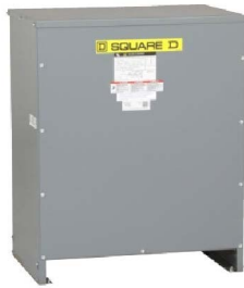
Style E—IP55 Rated

These dimensions are not for construction. Contact your local Schneider Electric representative for certified prints.