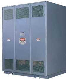
Style F—NEMA 1 Rated