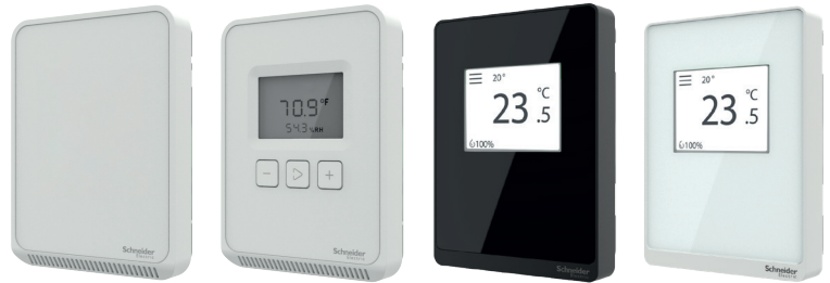
Note: A subset of models shown.