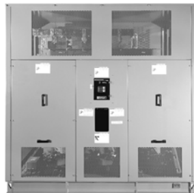
Power Dry II™