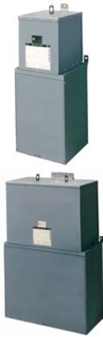
Table 14.11: Distribution System Square D Load Centers (allowing plug-on QO circuit breakers only)

New MPU solution leverages the latest load center interiors, giving customers more flexibility for branch circuit requirements. Additionally design with a tiered dead front construction. The first dead front allows access to the secondary main circuit breaker, distribution panel board, and the second dead front. The second dead front allows access to the primary main circuit breaker and incoming voltage connection points.