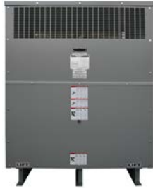
Style D, NEMA 1 Rated