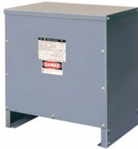
Style E—IP55 Rated

These dimensions are not for construction. Contact your local Schneider Electric representative for certified prints.