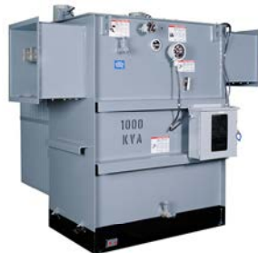
Liquid Filled Substation