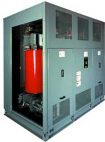
Power Cast II™

New! Revised Medium Voltage Transformer Energy Efficiency Information For 2016! In 2010 Schneider Electric released new efficiencies for MV transformers based on The Department of Energy (DOE) 10 CFR Part 431 Energy Conservation program for Commercial Equipment. We are now launching even more efficient transformers to further reduce energy consumption from MV transformers. Starting January 1, 2016 certain medium voltage distribution transformers with ratings of 2,500 kVA and below, 34.5 kV primary and below and 600 Vac class secondary voltages must meet revised minimum efficiency requirements. Liquid Filled Padmounts, Liquid Filled Substations, Dry Type VPI and Power Cast products shipped after January 1, 2016 will all be included. The minimum efficiency tables are listed below. Please contact your nearest Schneider Electric Sales Office for more information. Page 14-19 and 14-20 includes our updated offer.