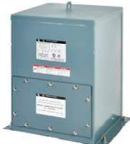
Style X—Type 4X Rated