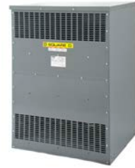
Style J—Type 1 Rated Converts to Type 2 with Drip Shield Converts to Type 3R with Weathershield