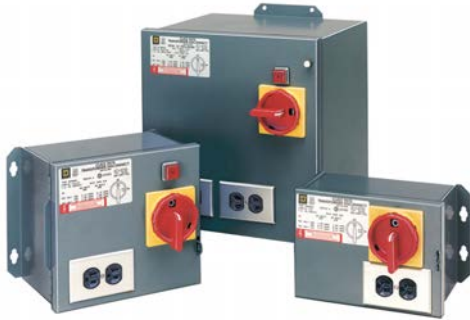
Transformer disconnects are available in NEMA Type 1 Standard, NEMA Type 12 Standard, and NEMA Type 1 Mini.

Square D™ brand transformer disconnects mount inside or outside a control system enclosure. The transformer disconnect being connected directly to the 480 Vac system controls power for auxiliary, single-phase loads when the main three-phase disconnect is either ON or OFF. The transformer disconnect is normally wired to the line side of the control panel's main disconnect.