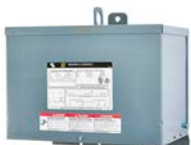
Style C—Type 3R Rated