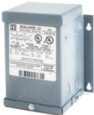
Style A—Type 3R Rated