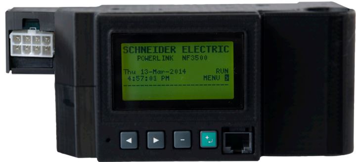
Powerlink™ NF3500G4 Controller