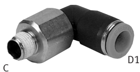
Push-in Elbow Fitting, NPT with Ball Bearing