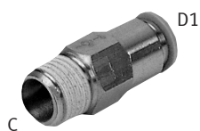
Push-in Straight Fitting, NPT, with Internal Shut-off