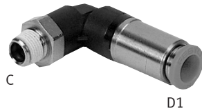
Push-in Elbow Fitting, NPT, with Internal Shut-off