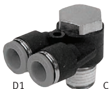
Push-in Elbow Y Fitting, NPT, with External Hex