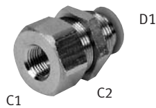
Push-in Bulkhead Fitting, with Female NPT Thread