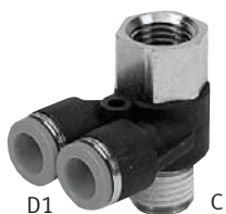
Push-in Elbow Y Fitting, NPT, with Male and Female Thread