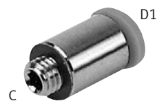
Push-in Straight Fitting, UNF, with Internal Hex