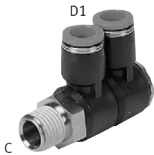
Push-in Double Elbow Fitting, NPT