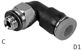
Push-in Elbow Fitting, UNF