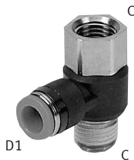
Push-in T Fitting, NPT, with Male and Female Thread