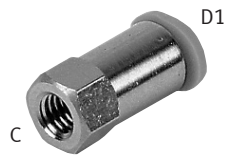
Push-in Straight Fitting, UNF, with Female Thread