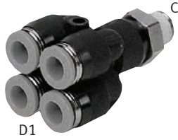
Push-in Double Y Fitting, NPT