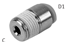
Push-in Straight Fitting, NPT, with Internal Hex