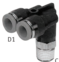
Push-in Elbow Y Fitting, NPT