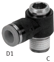
Push-in Elbow Fitting, NPT, with Internal Hex