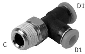
Push-in Branch T Fitting, NPT