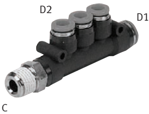
Push-in Triple Branch Reducing T Fitting, NPT