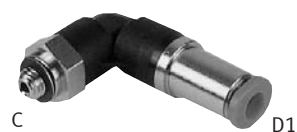
Push-in Elbow Fitting, UNF, with Internal Shut-off