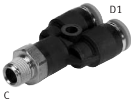
Push-in Y Fitting, NPT