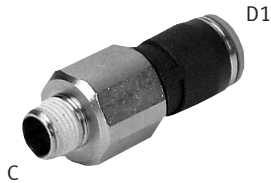
Push-in Straight Fitting, NPT with Ball Bearing