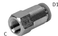
Push-in Straight Fitting, NPT, with Female Thread