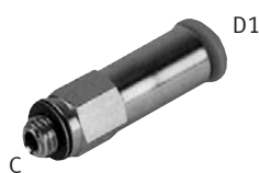
Push-in Straight Fitting, UNF, with Internal Shut-off