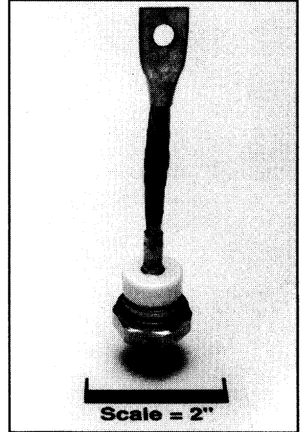
R502__10/R503__10 Fast Recovery Rectifier 100 Amperes Average, 1200 Volts