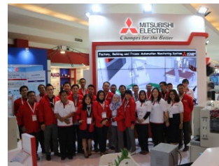
Mitsubishi Electric booth (Indonesia)

In order for Mitsubishi CNCs to be used with peace of mind, we will further bolster our service support in the Indonesian market which is expected to continue growing.