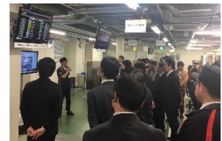
MMEG repair site tour