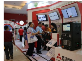
Mitsubishi CNC exhibit corner