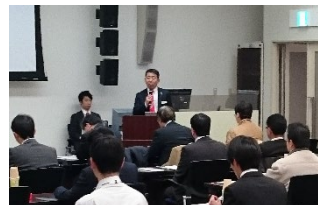
Mitsubishi Electric CNC new functions presentation

Customers showed great interest at the M800/M80/C80 series new functions and IoT solutions for machine tools presentations. We also received positive feedback in regards to our company's service principles "Whenever, Wherever, Forever" (which we adopted as our slogan) and the service system we provide from customers who attended the Mitsubishi Electric CNC Global Service presentation and tour of the MMEG repair site.