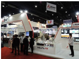
Mitsubishi Electric booth (Thailand)

Mitsubishi Electric exhibited its latest M800, M80, C80 series computerized numerical controllers (hereafter, "CNCs") at the largest machine tools exposition in the ASEAN region "METALEX2017" in Bangkok, Thailand. Lathe and machining center solutions, as well as operation monitoring in the Mitsubishi Electric CNC booth were showcased. We displayed our service content and extended maintenance contract service, attracting a lot of interest from machine tool users. Approximately 30% of exhibited machinery used Mitsubishi Electric CNCs. We will continue to support our users by further improving our services.