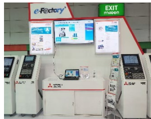
Operation monitoring exhibit