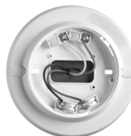
Model SBGA-34 (Front View)

Model SBGA-34 can be used with the following Siemens fire systems: FireFinder XLS, Cerberus PRO, FireSeeker FS-250 and PAD-series NAC Extenders.