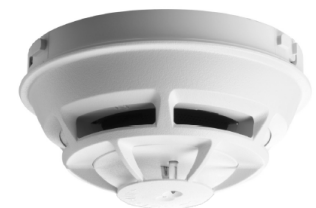
Model FDOT421 Multi-Criteria Fire Detector

The signal processing with detection algorithms allows the detector to first gather smoke and thermal data, and then analyze this information in the detector's 'neural network.' By comparing data received with the common characteristics of fires or fire signatures, Model FDOT421 can compare these signals to those of deceptive phenomena that cause other detectors to trigger a false alarm.