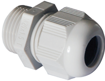
ABB cable glands – RNCG series Nylon, rail specific EN45545

EN45545 Compliant cable gland for use in rail, rolling stock and infrastructure applications.