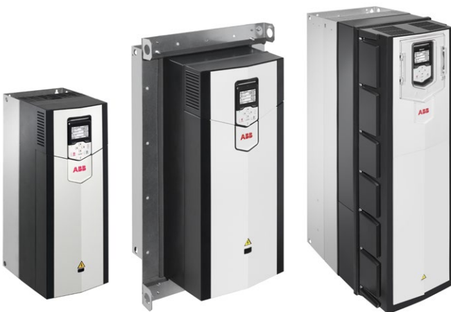
The ACS880 product family is available in a power range from 0.55 to 5600 kW and at voltages of 230, 400, 500 and 690 V. The enclosure class options are IP20, IP21 and IP55.

The need for efficient and safe operation imposes strict demands on construction elevator design. The movement of the elevator must be precise and smooth, even in demanding environments. That's why the elevator control has to be selected carefully. Because everything counts.