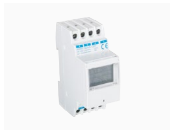
Astronomic Time Clocks