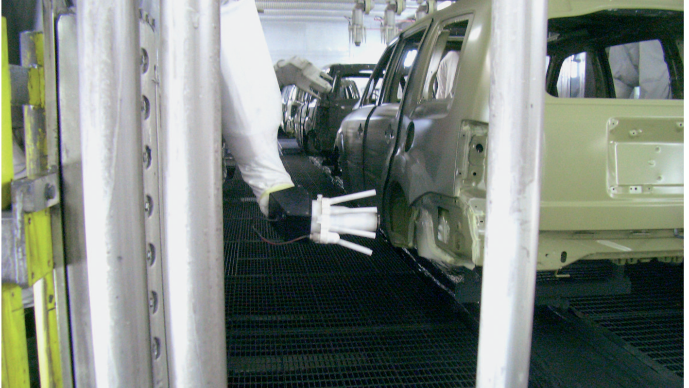
ABB paint application equipment upgrades Save up to 20% on paint and associated maintenance costs

Is your existing paint application equipment costing you money? Are you paying for expensive paint that does not end up on the part?