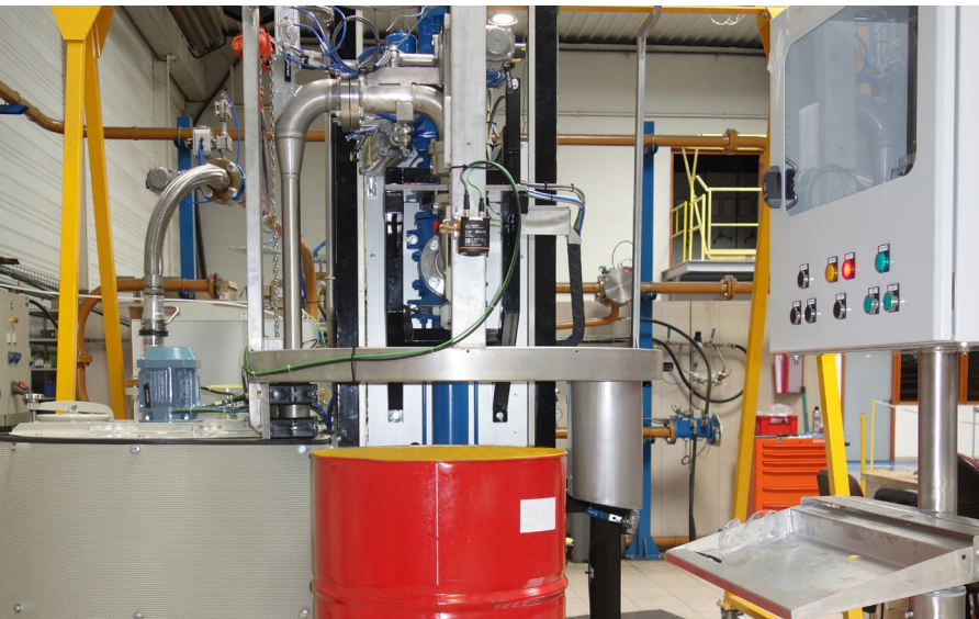
ABB High Viscosity Drum Decanting System - DDS HV - is designed to pump and dose highly viscous liquids from drums and to incorporate them in formulation processes. It is recommended when high accuracy dosing and repeatability is required.

Emptying, dosing and rinsing station for drums