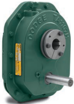
ABB offers a variety of Dodge gear reducers that have been outperforming competitors for decades. This reliability provides less downtime and thus feeds productivity.