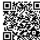
Fieldbus communications web page

For more information on ABB fieldbus options and protocols, see the fieldbus communications web page ( new.abb.com/drives/connectivity/fieldbus-connectivity ).