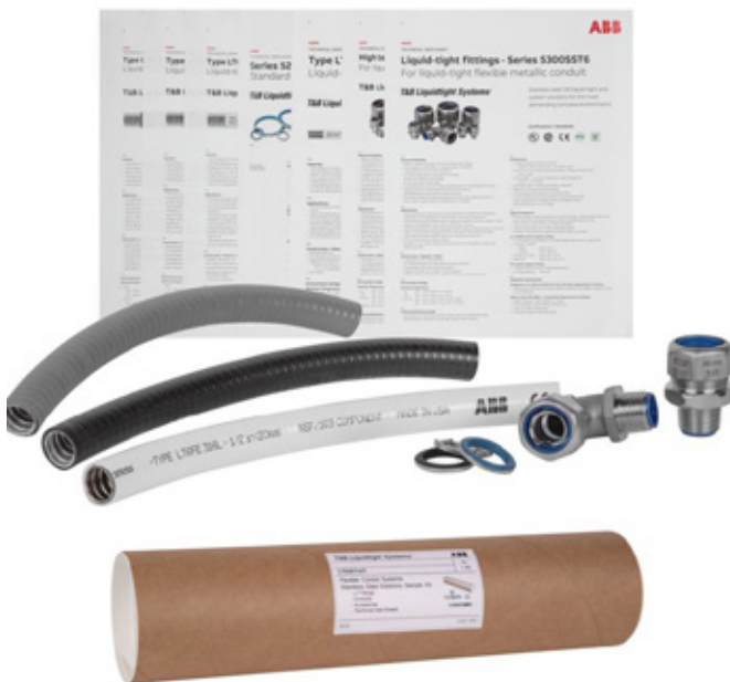
ABB Installation Products Inc. Electrification Business 860 Ridge Lake Blvd. Memphis, TN 38120

ABB has made every attempt to ensure the accuracy and reliability of the contents of this document. However, all content is provided for general informational purposes only, and ABB makes no guaranty or warranty, express or implied, as to the accuracy of any technical content, or that the information contained in this publication will be error free and all such guarantees or warranties are expressly disclaimed. ABB may change or modify