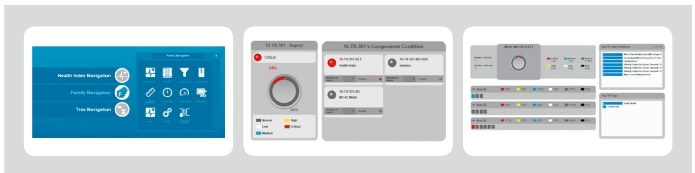
Easy to use dashboards and interfaces help your staff improve maintenance activities: (a) Maintenance workplace (b) Intuitive navigation through mining production equipment (c) Dynamic maintenance KPIs